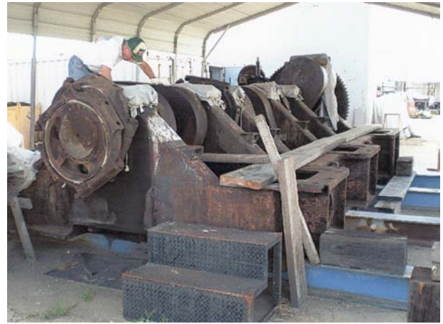
The engine bed plate with crankshaft in place, an early step in rebuilding the engine.