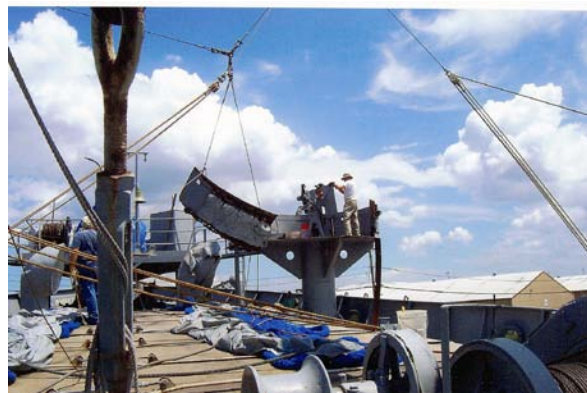
With the segment of the gun tub shield completely separated from the mounting platform, the ship's cargo hoist is swinging it across the hatch and will land it on the pier.

A significant task undertaken by the electrical gang was the complete replacement of the lighting system in #1 lower hold. In a space originally designed to carry cargo, lighting was not particularly important and temporary lighting, in the form of cluster lights, could be used to increase illumination when working cargo at night. On JOHN W. BROWN, #1 lower hold is used as a large bos'n's store room and working area by the deck department. Good lighting is essential. The newly installed lighting system now provides that without the need for portable lighting.