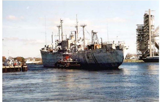
Ex-PROTECTOR (AGR-11) being towed from Norfolk, VA, in 2004, enroute to Brownsville, TX, for scrapping.

The engine bed plate is resting on 12 inch “I” beams which lie on a concrete slab with a cover over it. The jacking engine (used to rotate the engine at slow speed when making repairs) has been rebuilt and painted and is being used to move the engine components as volunteers work on the bearings. While progress is slow, this promises to be a unique and interesting display once completed and will be another opportunity for people to see an actual Liberty ship triple expansion engine.