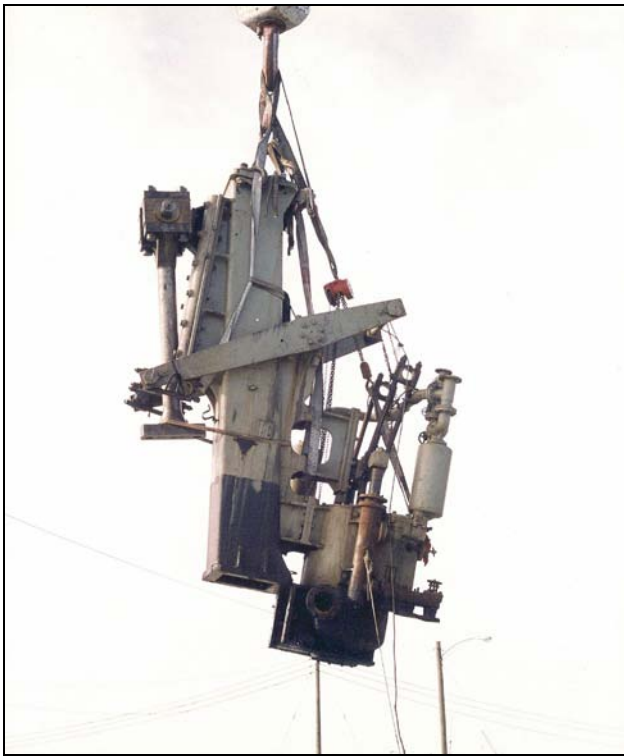
The after port column the engine with the attached air pump, being lifted out of the ship.