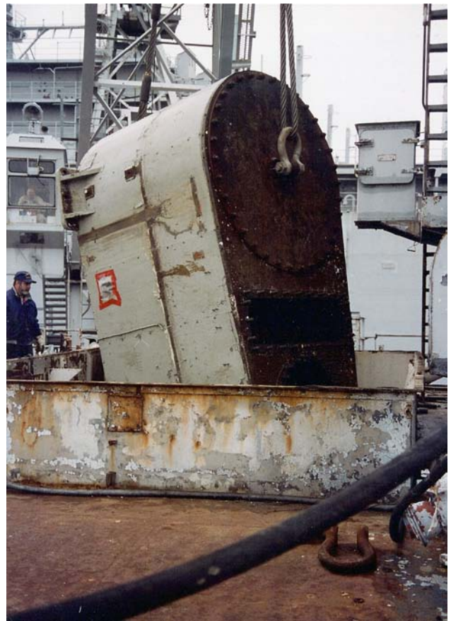
The engine cylinder casing is being lifted through the engine room skylight – a heavy lift and a tight fit!