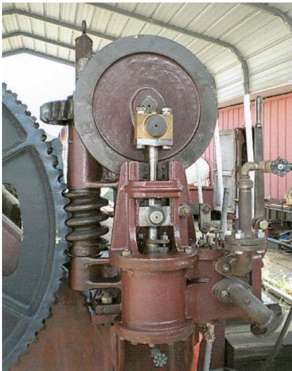
The restored jacking gear mounted on the engine bed plate and ready for use.

The last pieces of the cut-away boiler used by the schoolship as a training aid were removed from #3 lower hold. The deck area where the boiler had been sitting was preserved and painted. (The boiler components removed will be donated to an organization that will re-erect the boiler as an engineering display. While these components have some scrap value, we decided to forego that income so that this piece of Liberty ship equipment will be preserved and displayed.)